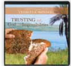
Trusting the God of Impossibilities by Charles R. Swindoll CD series