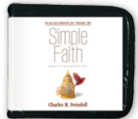
Simple Faith: Discovering What Really Matters by Charles R. Swindoll CD series