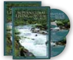
Supernatural Living in a Secular World by Charles R. Swindoll DVDs and Bible Companion (NTSC and PAL format)