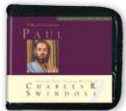
Paul: A Man of Grace and Grit by Charles R. Swindoll CD series

To order any of these related resources, call 0800-787-9364 or visit www.insightforliving.org.uk