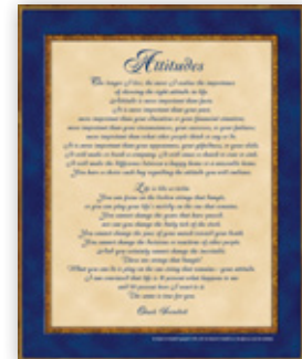
Attitudes Quote Color Print by Charles R. Swindoll color print

For related resources, please call USA 1-800-772-8888 • AUSTRALIA 1300 467 444 • CANADA 1-800-663-7639 • UK 0800 787 9364