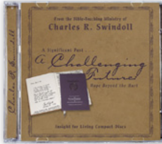
A Significant Past . . . A Challenging Future by Charles R. Swindoll compact disc set