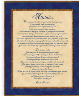
Attitudes Quote Color Print by Charles R. Swindoll color print

For related resources, please call USA 1-800-772-8888 • AUSTRALIA 1300 467 444 • CANADA 1-800-663-7639 • UK 0800 787 9364