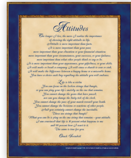
Attitudes Quote Color Print by Charles R. Swindoll color print

For related resources, please call USA 1-800-772-8888 • AUSTRALIA 1300 467 444 • CANADA 1-800-663-7639 • UK 0800 787 9364