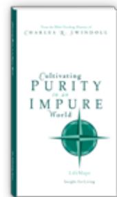
Cultivating Purity in an Impure World by Insight for Living LifeMaps softcover book