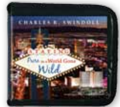
Staying Pure in a World Gone Wild by Charles R. Swindoll CD series