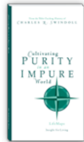
Cultivating Purity in an Impure World by Insight for Living LifeMaps softcover book