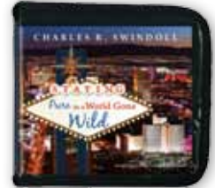
Staying Pure in a World Gone Wild by Charles R. Swindoll CD series