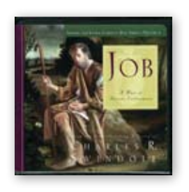
Job: A Man of Heroic Endurance by Charles R. Swindoll compact disc series