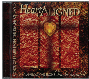
Heart Aligned: Songs of Praise from the Psalms of David with Living Applications from Chuck Swindoll music CD