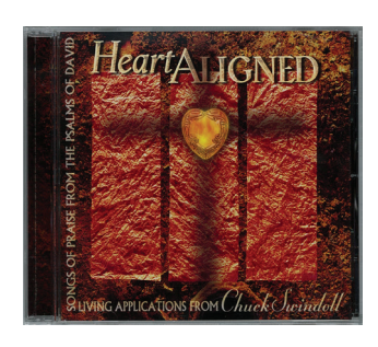
Heart Aligned: Songs of Praise from the Psalms of David with Living Applications from Chuck Swindoll music CD