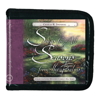
Songs for All Seasons from the Psalms by Charles R. Swindoll and Insight for Living Ministries CD series