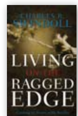
Living on the Ragged Edge by Charles R. Swindoll softcover book

To order any of these related resources, call 0800-915-9364 or visit www.insightforliving.org.uk