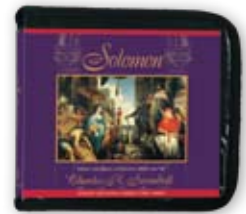
Solomon by Charles R. Swindoll compact disc series