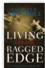
Living on the Ragged Edge by Charles R. Swindoll softcover book

To order any of these related resources, call 0800-915-9364 or visit www.insightforliving.org.uk