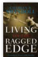
Living on the Ragged Edge by Charles R. Swindoll softcover book

To order any of these related resources, call 0800-915-9364 or visit www.insightforliving.org.uk