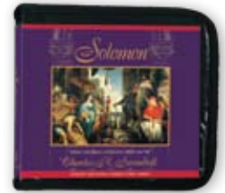
Solomon by Charles R. Swindoll compact disc series