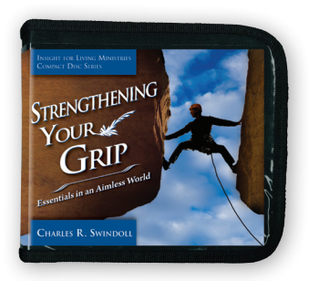
Strengthening Your Grip by Charles R. Swindoll CD series

For these and related resources, visit www.insightworld.org/store or call USA 1-800-772-8888 • AUSTRALIA +61 3 9762 6613 • CANADA 1-800-663-7639 • UK +44 1306 640156