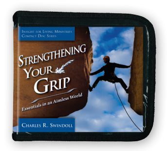
Strengthening Your Grip by Charles R. Swindoll CD series

For these and related resources, visit www.insightworld.org/store or call USA 1-800-772-8888 • AUSTRALIA +61 3 9762 6613 • CANADA 1-800-663-7639 • UK +44 1306 640156