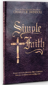
Simple Faith Bible Companion by Charles R. Swindoll softcover Bible Companion