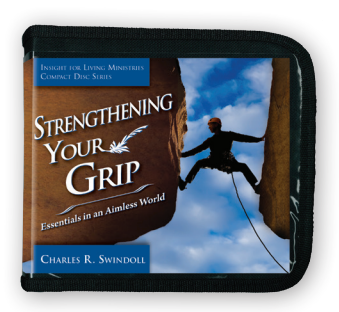
Strengthening Your Grip by Charles R. Swindoll CD series

For these and related resources, visit www.insightworld.org/store or call USA 1-800-772-8888 • AUSTRALIA +61 3 9762 6613 • CANADA 1-800-663-7639 • UK +44 1306 640156