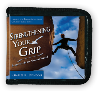
Strengthening Your Grip by Charles R. Swindoll CD series

For these and related resources, visit www.insightworld.org/store or call USA 1-800-772-8888 • AUSTRALIA +61 3 9762 6613 • CANADA 1-800-663-7639 • UK +44 1306 640156