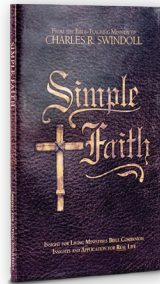
Simple Faith Bible Companion by Charles R. Swindoll softcover Bible Companion