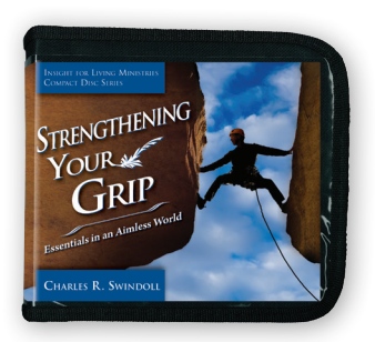
Strengthening Your Grip by Charles R. Swindoll CD series

For these and related resources, visit www.insightworld.org/store or call USA 1-800-772-8888 • AUSTRALIA +61 3 9762 6613 • CANADA 1-800-663-7639 • UK +44 1306 640156