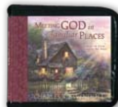
Meeting God in Familiar Places by Charles R. Swindoll compact disc series