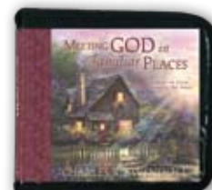
Meeting God in Familiar Places by Charles R. Swindoll compact disc series