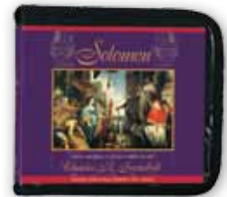
Solomon by Charles R. Swindoll CD series

To order any of these related resources, call 0800-787-9364 or visit www.insightforliving.org.uk