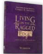
Living on the Ragged Edge Workbook by Insight for Living softcover workbook