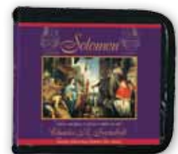
Solomon by Charles R. Swindoll CD series

To order any of these related resources, call 0800-787-9364 or visit www.insightforliving.org.uk