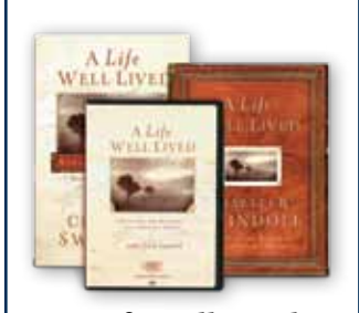
A Life Well Lived by Charles R. Swindoll - Gift Set paperback book, Bible Companion, and 2 DVDs