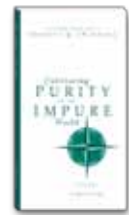
Cultivating Purity in an Impure World by Insight for Living paperback book