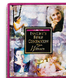
Insight's Bible Companion for Women softcover book

To order any of these recommended resources, call 0800-915-9364 or visit www.insightforliving.org.uk