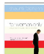
For Women Only: What You Need to Know about the Inner Lives of Men by Shaunti Feldhahn hardcover book