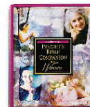
Insight's Bible Companion for Women softcover book

To order any of these recommended resources, call 0800-915-9364 or visit www.insightforliving.org.uk