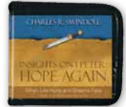
Insights on 1 Peter Hope Again: When Life Hurts and Dreams Fade by Charles R. Swindoll CD Series