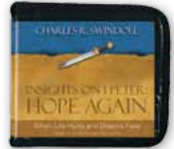
Insights on 1 Peter Hope Again: When Life Hurts and Dreams Fade by Charles R. Swindoll CD Series