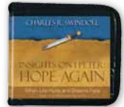
Insights on 1 Peter Hope Again: When Life Hurts and Dreams Fade by Charles R. Swindoll CD Series