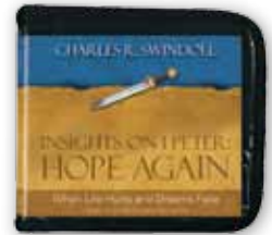
Insights on 1 Peter Hope Again: When Life Hurts and Dreams Fade by Charles R. Swindoll CD Series