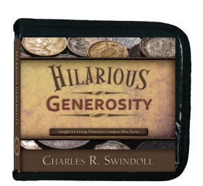
Hilarious Generosity by Charles R. Swindoll CD series