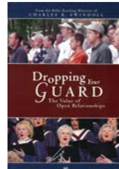
Dropping Your Guard: The Value of Open Relationships by Charles R. Swindoll softcover book

For these and related resources, visit www.insightworld.org/store or call USA 1-800-772-8888 • AUSTRALIA +61 3 9762 6613 • CANADA 1-800-663-7639 • UK +44 1306 640156