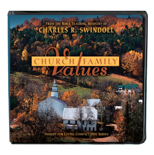
Church Family Values by Charles R. Swindoll CD series