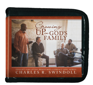
Growing Up in God's Family by Charles R. Swindoll CD series