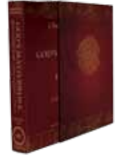
God's Masterwork, Volume Six: Letters to God's People—A Survey of Romans–Philemon by Charles R. Swindoll Classic CD series of 13 CDs