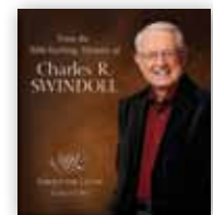
“God's Love in Romans 8” Meeting God in Familiar Places by Charles R. Swindoll CD

To order any of these related resources, call 0800-787-9364 or visit www.insightforliving.org.uk