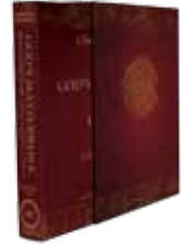
God's Masterwork, Volume Six: Letters to God's People—A Survey of Romans—Philemon by Charles R. Swindoll Classic CD series of 13 CDs