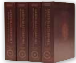
God's Masterwork, Volumes One–Four (A Survey of the Old Testament) by Charles R. Swindoll Classic CD series of 40 CDs