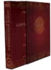
God's Masterwork, Volume Five: God With Us—A Survey of Matthew—Acts by Charles R. Swindoll Classic CD series of 6 CDs