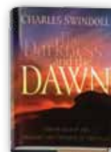
The Darkness and the Dawn: Empowered by the Tragedy and Triumph of the Cross by Charles R. Swindoll hardback book

To order any of these related resources, call 0800-787-9364 or visit www.insightforliving.org.uk