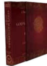
God's Masterwork, Volume Five: God With Us—A Survey of Matthew—Acts by Charles R. Swindoll Classic CD series of 6 CDs