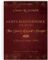
God's Masterwork Volume Two The Story of God's People—A Survey of Joshua–Esther by Charles R. Swindoll CD series