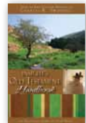
Insight's Old Testament Handbook: A Practical Look at Each Book by Insight for Living softcover book

To order any of these related resources, call 0800-915-9364 or visit www.insightforliving.org.uk