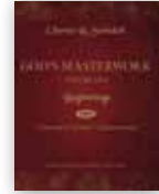
God's Masterwork Volume One Beginnings—A Survey of Genesis–Deuteronomy by Charles R. Swindoll CD Series