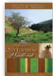
Insight's Old Testament Handbook: A Practical Look at Each Book by Insight for Living softcover book

To order any of these related resources, call 0800-915-9364 or visit www.insightforliving.org.uk