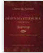
God's Masterwork Volume One Beginnings—A Survey of Genesis–Deuteronomy by Charles R. Swindoll CD Series