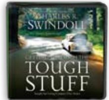
Getting Through the Tough Stuff It's Always Something! by Charles R. Swindoll CD series