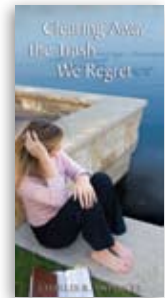
Clearing Away the Trash We Regret by Charles R. Swindoll booklet