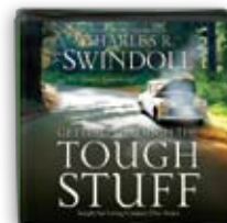
Getting Through the Tough Stuff It's Always Something! by Charles R. Swindoll CD series