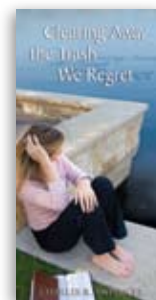
Clearing Away the Trash We Regret by Charles R. Swindoll booklet