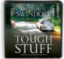
Getting Through the Tough Stuff It's Always Something! by Charles R. Swindoll CD series