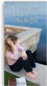
Clearing Away the Trash We Regret by Charles R. Swindoll booklet