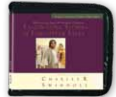
Fascinating Stories of Forgotten Lives: Rediscovering Some Old Testament Characters by Charles R. Swindoll CD series of 14 CDs