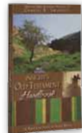
Insight's Old Testament Handbook: A Practical Look at Each Book by Insight for Living paperback book

To order any of these related resources, call 0800-787-9364 or visit www.insightforliving.org.uk