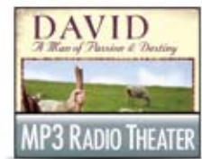
David: A Man of Passion & Destiny, Part 1 MP3 Radio Theater by Insight for Living download only

To order any of these related resources, call 0800-915-9364 or visit www.insightforliving.org.uk