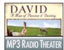
David: A Man of Passion & Destiny, Part 1 MP3 Radio Theater by Insight for Living download only

To order any of these related resources, call 0800-915-9364 or visit www.insightforliving.org.uk