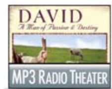
David: A Man of Passion & Destiny, Part 1 MP3 Radio Theater by Insight for Living download only

To order any of these related resources, call 0800-915-9364 or visit www.insightforliving.org.uk